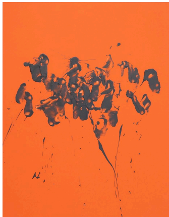
「knock 2026 #V×GS11」90×70cm

Major solo exhibitions include “ Hone Intuition ” (JD Malat Gallery, Dubai, 2026) and “ Rest in Silver ” (JD Malat Gallery, London, 2024). Recent group exhibitions include ART FAIR TOKYO (2024, 2025) and “ New Kyoto IMA KYOTO ” (Galerie Taménaga Kyoto, 2025).