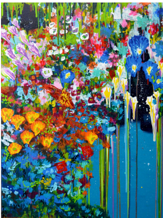
「Night Garden III」130×97cm