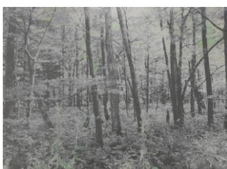
「Mirage #113」 110×150 cm

Her major solo exhibitions include Knock Knock: Knocking on the Door of Boundaries (The Triangle, Kyoto City KYOCERA Museum of Art, 2025) and Through the Veil, Across the Rub (GINZA TSUTAYA BOOKS, Tokyo, 2025). In 2019, Yakushigawa was honored with the Shiga Prefecture Next-Generation Culture Award.