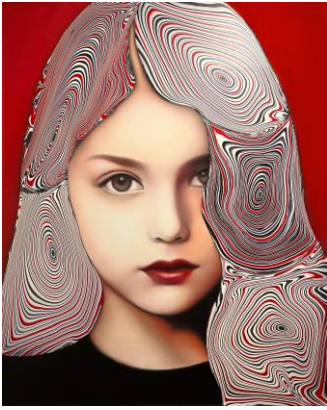
【Jane Doe】 162×130 cm