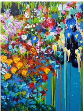
「Night GardenIII」 130×97 cm