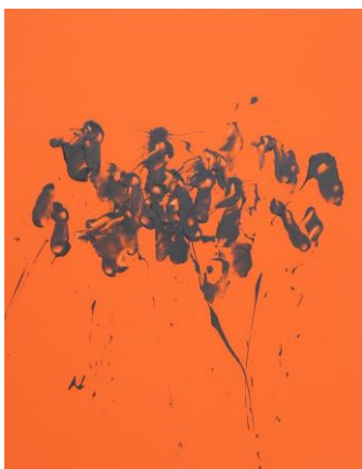
「knock 2026 #V×GS11」 90×70 cm

Nakahira's major solo exhibitions include Collection II (Salon Mosaic, Osaka, 2025), alongside notable group showcases such as ART SESSION at GINZA TSUTAYA BOOKS (Tokyo, 2025). Extending her distinct visual voice into literature, Nakahira also created the cover illustrations for Naoki Prize-winning author Shino Sakuragi's celebrated novels, Hotel Royal , Kazokujimai , and Hadaka no Hana (Shueisha Bunko).