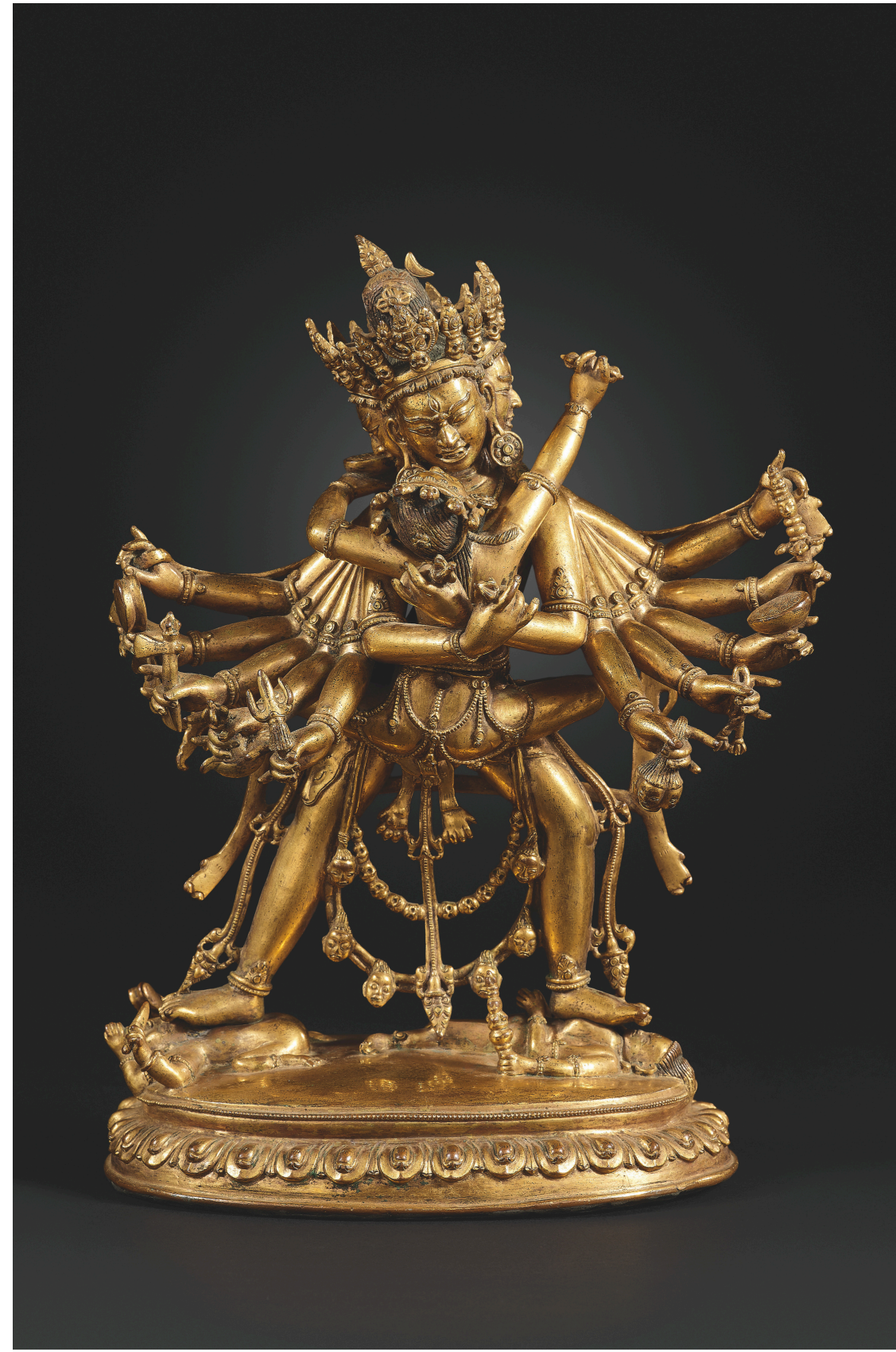
A copper alloy figure of Chakrasamvara Tibet, 15th century H. 23 cm Estimate : 30,000 - 50,000 EUR Digard Auction Auction on 9 June, Hôtel Drouot