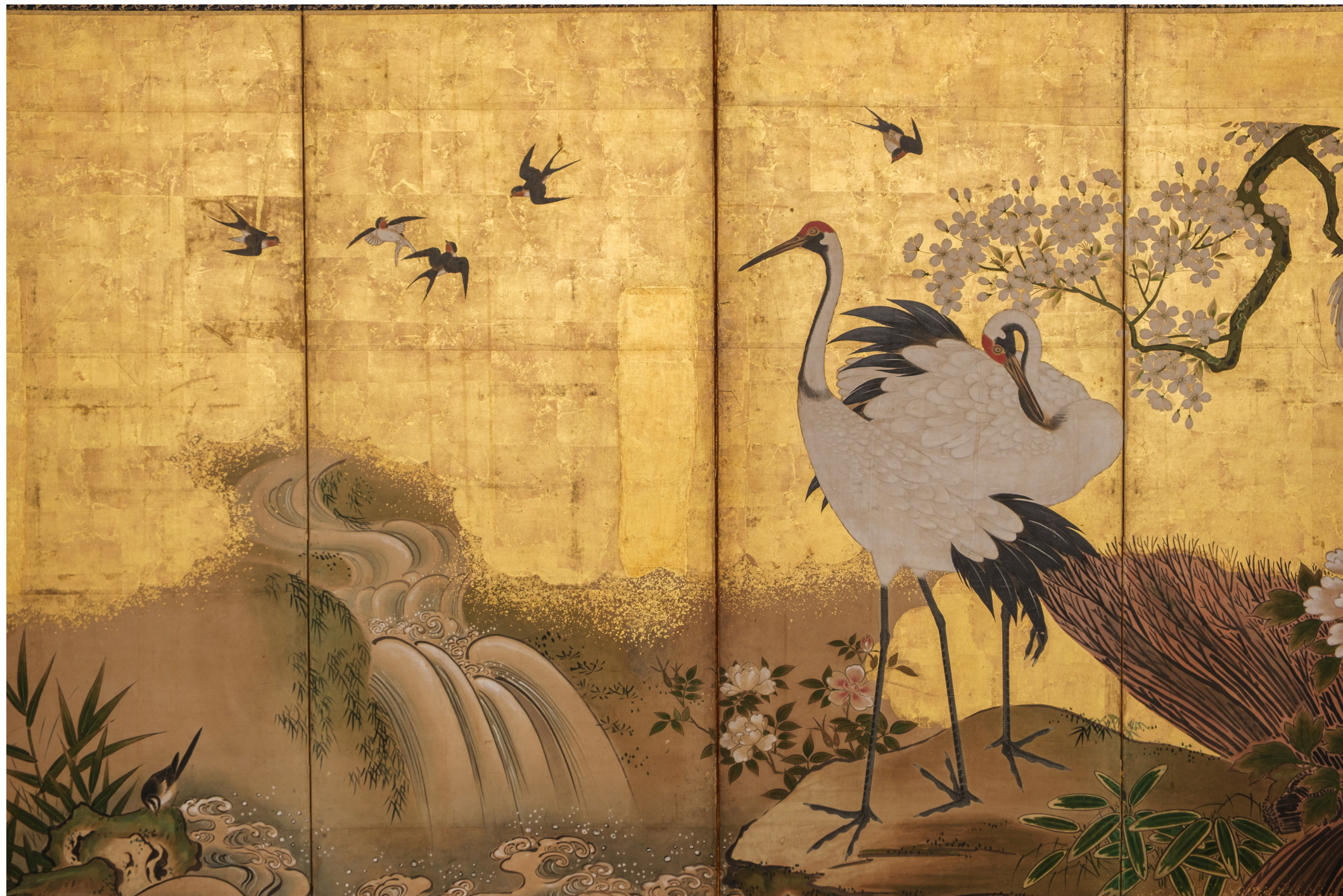
Six-panel folding screen (byōbu) Japan, Edo period, 18th century 170 x 364 cm Estimate: 11,000 - 13,000 EUR Online auction: 5-12 June on Catawiki