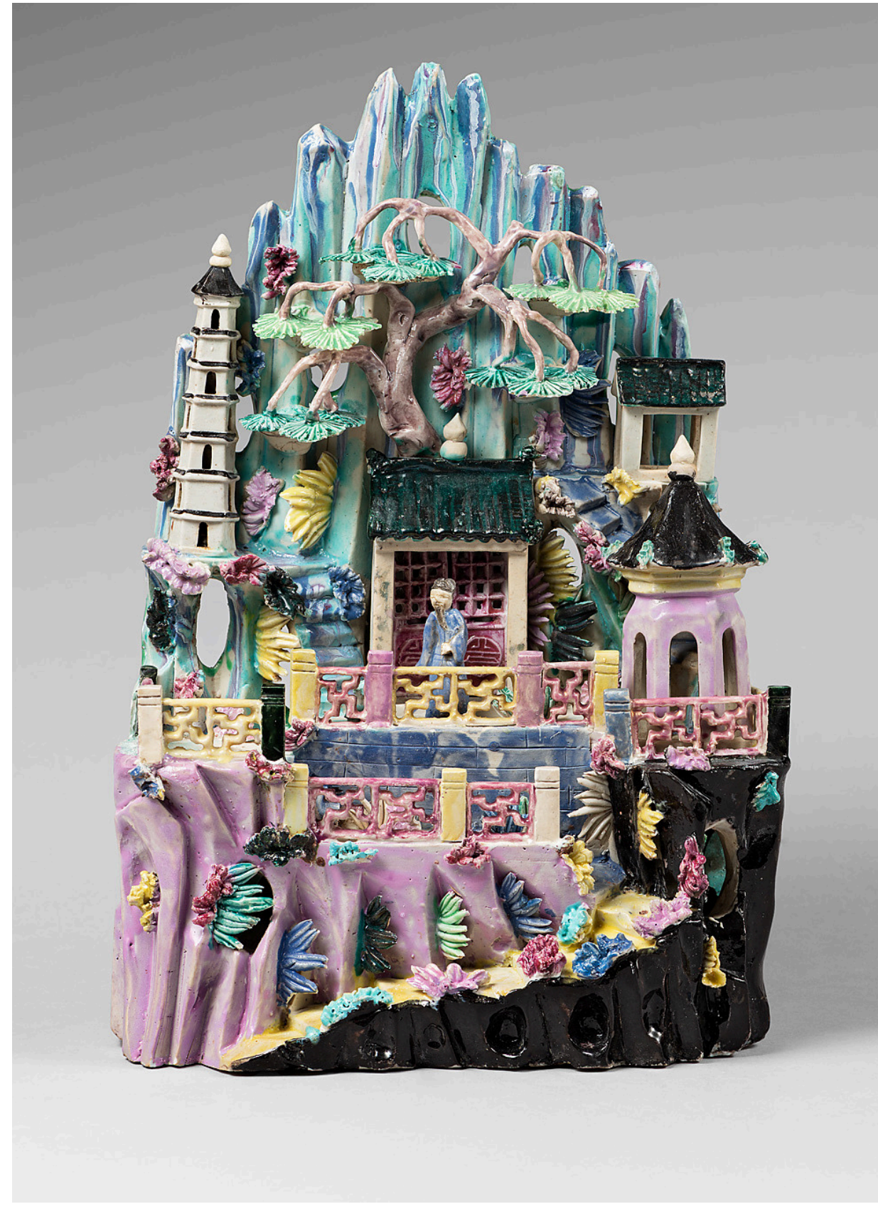
A famille rose enamelled mountain China, Qianlong period (1736-1795), c. 1760 H. 34 cm Price: 15,000 EUR Galerie Nicolas Fournery